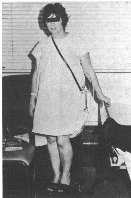
FIG 1—Compact transmitter worn on shoulder strap by patient.

Radiotelemetry —A small battery-operated transmitter (Hewlett Packard 78100A) which was used in our original work on the telemetry of the fetal heart signal was adapted in the department of medical physics to include intrauterine pressure by means of a multiplexing unit so that the system could record intrauterine pressure and fetal heart rate simultaneously. The signals obtained from the presenting part electrode and intrauterine pressure catheter were combined or multiplexed in the combining unit, which was incorporated into the transmitter. The combined signal was then radioed to a receiver